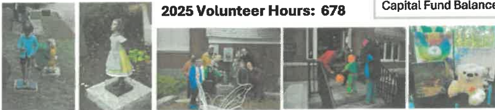
2025 Volunteer Hours: 678